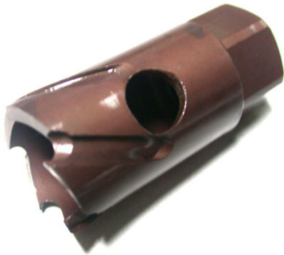
Special drills for oil pipe