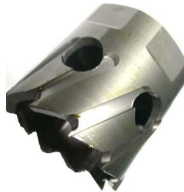
Special drills for oil pipe